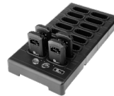
Auri D16 Docking Station 16